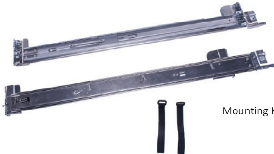
Mounting Kit (Mounting Brackets Shown)